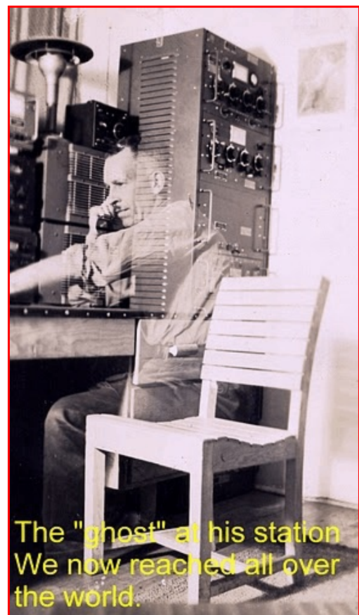
The "ghost" at his station We now reached all over the world.